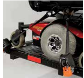
Retractable belt securement for powerchairs/scooters (ASL-250B).