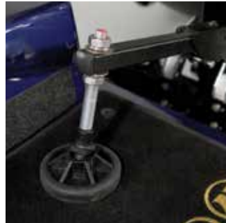
Hold-Tite foot securement for scooters (ASL-250A).