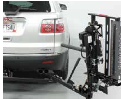
Swing-Away: Easy access to hatch/cargo space.