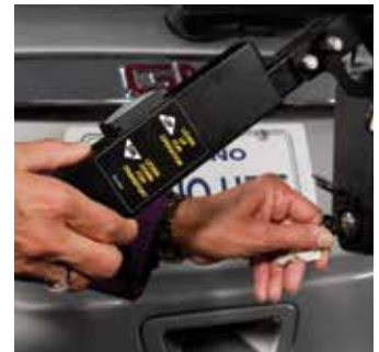
One-button operation with built-in safety latch to prevent unintentional platform lowering.