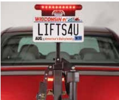
Low-profile third brake light.