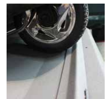
Wheel chock kit required for FWD powerchairs.