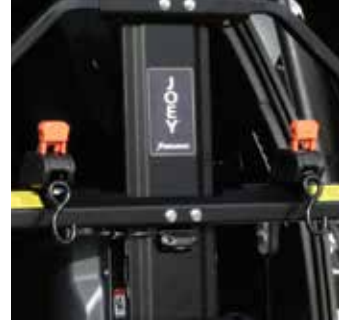
Barrier belt kit* includes two retractable securement straps for added peace of mind. *Required in some vehicles