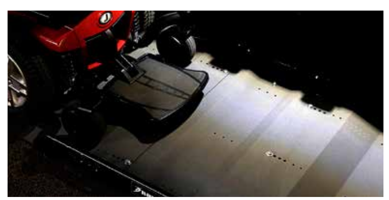
Platform illumination for night loading.