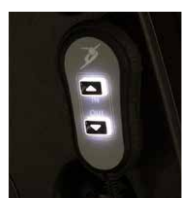
One button control with indicator light.