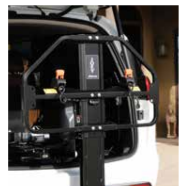
Industry-exclusive safety barrier. Protected by US Utility Patent No. 403.615