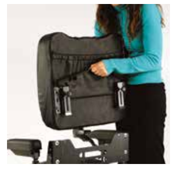
Back-Off easily removes back of mobility device to fit into shorter vehicle openings.